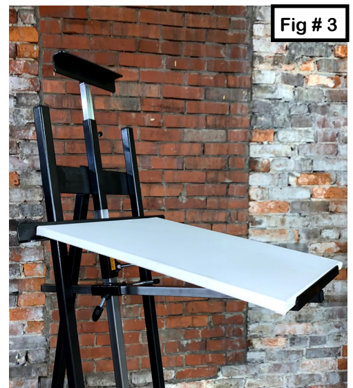
Fig # 3

Need Help? Call us at (419) 884-2900 with questions or comments.