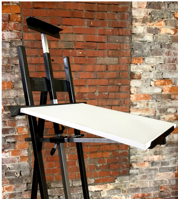
Spectrum Studio (SS100)

Need Help? Call us at (419) 884-2900 with questions or comments.