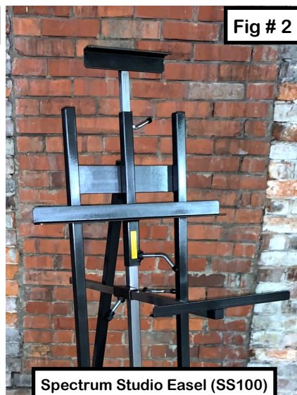
Fig # 2