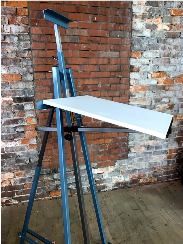
Collegiate Easel (CE100)