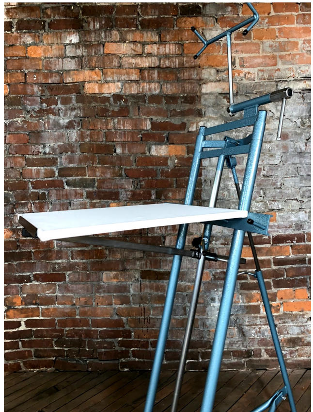
Pro Easel (PE100)