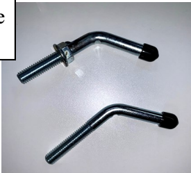
Steel Lever Handle (2 per easel)

To keep your Klopfenstein Equipment in proper working order, we recommend all unpainted uprights and extensions be wiped down with a rag or paper towel sprayed with a light oil (like WD40 lubricant) on a monthly bases, or as needed. This is the only maintenance that should be required.