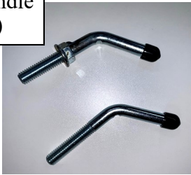
Steel Lever Handle (2 per easel)

To keep your Klopfenstein Equipment in proper working order, we recommend all unpainted uprights and extensions be wiped down with a rag or paper towel sprayed with a light oil (like WD40 lubricant) on a monthly bases, or as needed. This is the only maintenance that should be required.