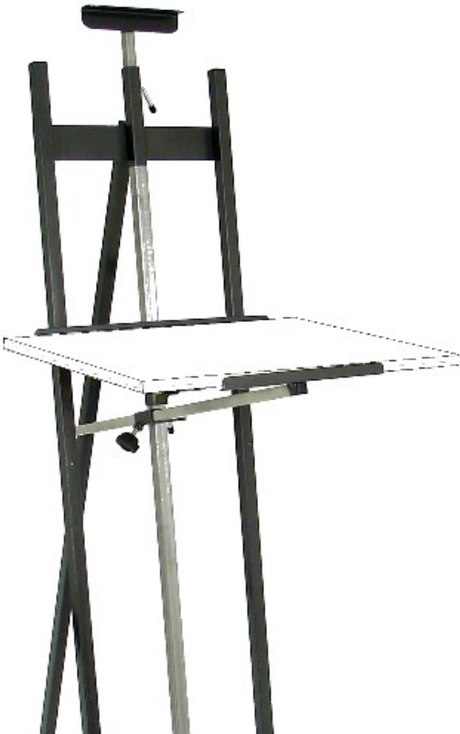
Spectrum Studio (SS100)

Need Help? Call us at (419) 884-2900 with questions or comments.