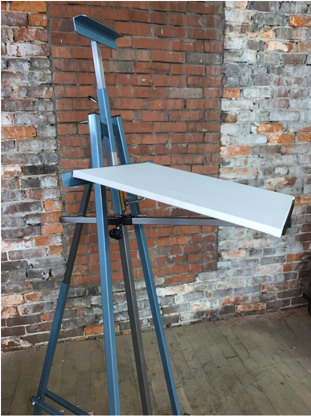
Collegiate Easel (CE100)