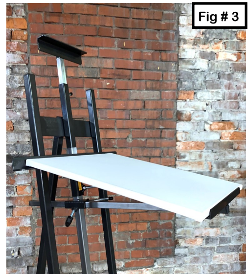
Fig # 3

Need Help? Call us at (419) 884-2900 with questions or comments.