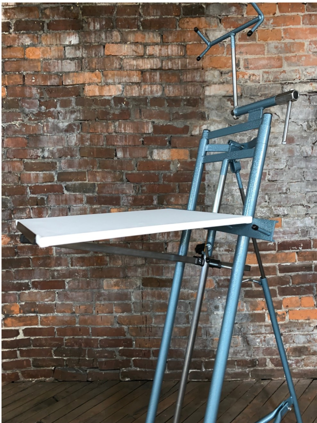
Pro Easel (PE100)